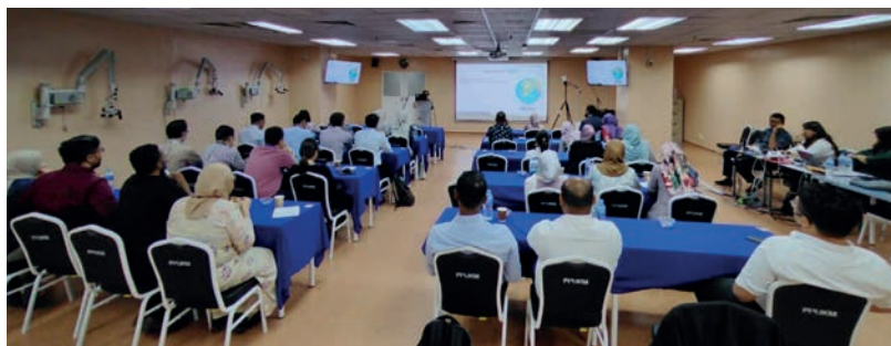
Ongoing lecture by various diciplines.