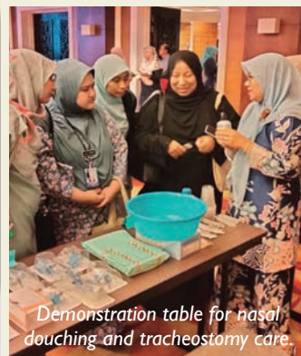
Demonstration table for nasal douching and tracheostomy care.