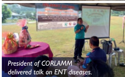
President of CORLAMM delivered talk on ENT diseases.