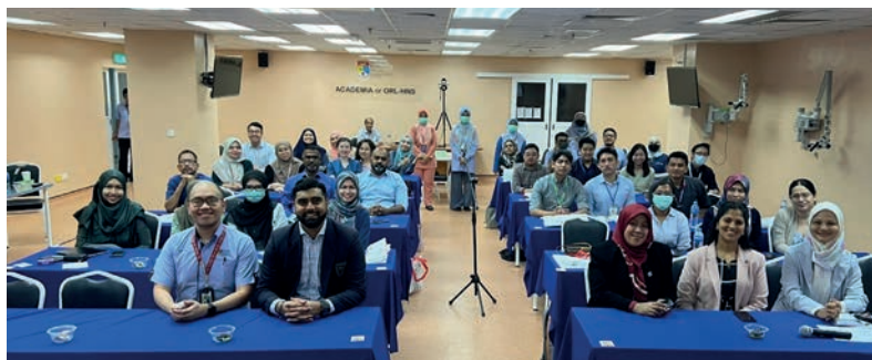
The Spacious Academia of ENT which provided a good platform for lectures and demonstration.