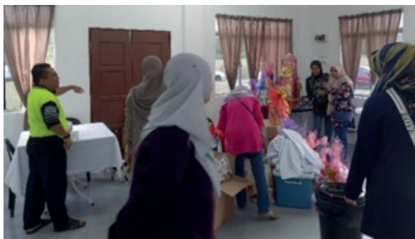
Small briefing with arrangement of tables, prizes and door gifts.