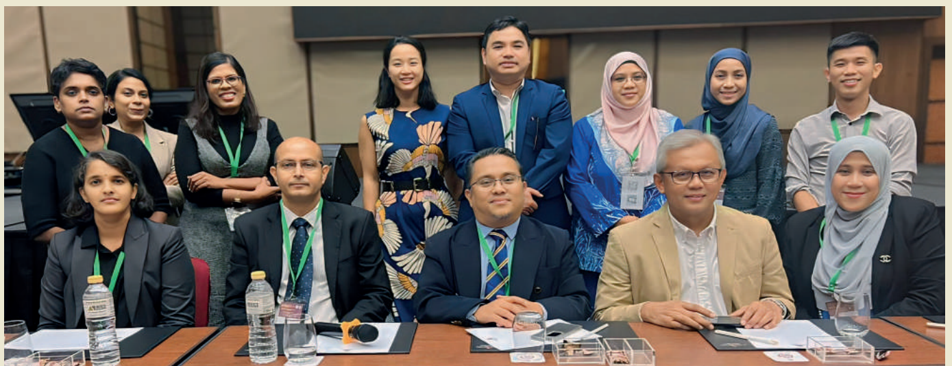
Executive Committee of College of Otorhinolaryngologists – Head and Neck Surgeons, AMM Malaysian Society of Otorhinolaryngologists – Head and Neck Surgeons

Malaysian Society of Otorhinolaryngologists – Head and Neck Surgeons