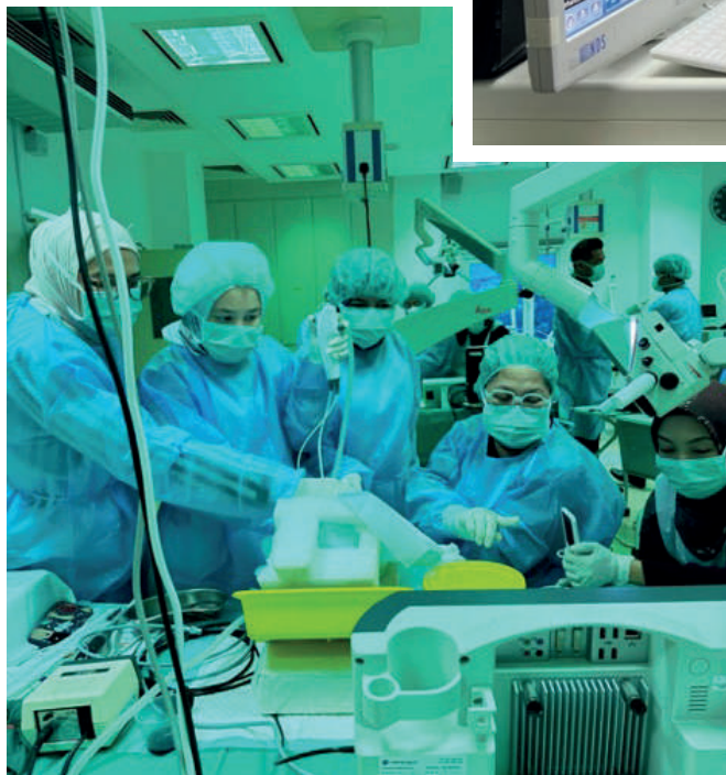
Dissectors perform various office based and operative procedures on human head and neck cadavers using flexible endoscope, suspension laryngoscope and microscope.