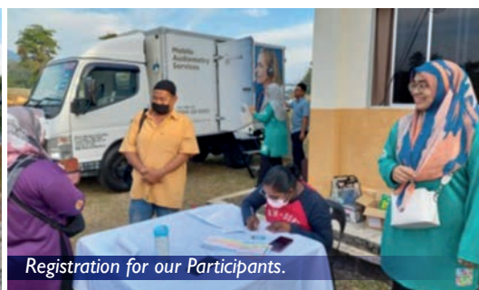
Registration for our Participants.