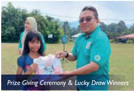
Prize Giving Ceremony & Lucky Draw Winners