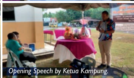
Opening Speech by Ketua Kampung.