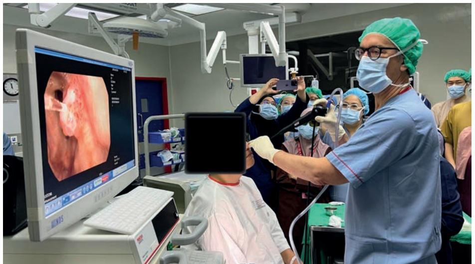
Professor Dr Markus Hess demonstrating endoscopic office based Blue LASER treatment on a patient with recurrent respiratory papillomatosis at our live surgery session.

Stay connected with Department of Otorhinolaryngology – Head and Neck Surgery, Universiti Kebangsaan Malaysia, for updates on future workshops and events that continue to push the boundaries of medical education and practice. Together, we advance toward a future where every surgical intervention is as safe, effective, and minimally invasive as possible.