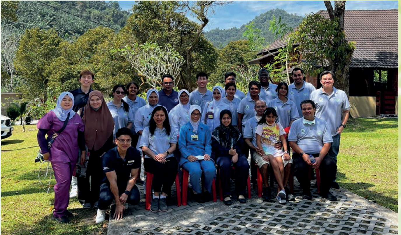
ENT doctors with the Gopeng Health Clinic nurses, with student volunteers and sponsors.

A health camp was held on 18 th February 2023 at Gopeng Highlands Resort for four Orang Asli settlements with the collaboration of Gopeng Health Clinic. Cancer screening was done by us, while blood test and vital statistics was done by Gopeng Clinic staff. Patients were referred to nearby Hospital Raja Permaisuri Bainun and Gopeng Health Clinic for further management.