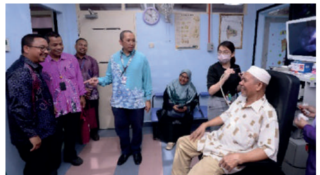
(more photos on page 22)