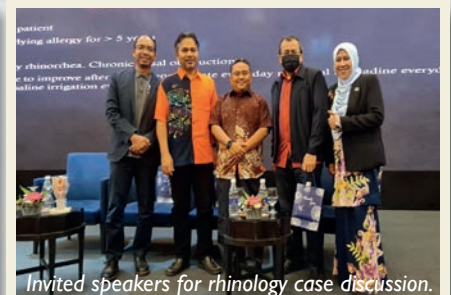
Invited speakers for rhinology case discussion.