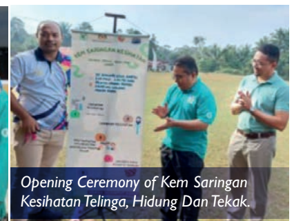
Opening Ceremony of Kem Saringan Kesihatan Telinga, Hidung Dan Tekak.