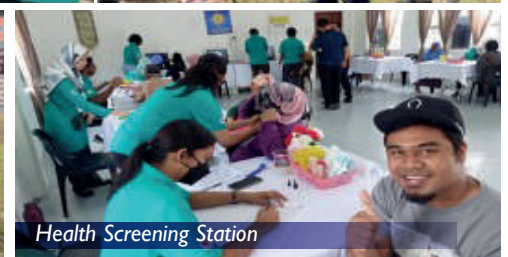
Health Screening Station